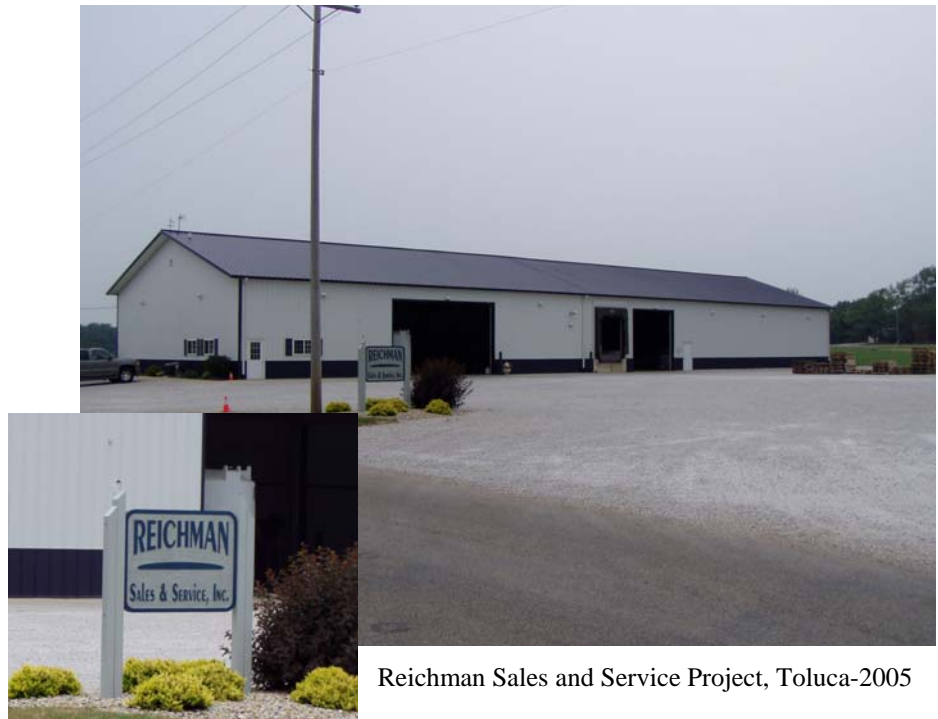
Reichman Sales and Service Project, Toluca-2005