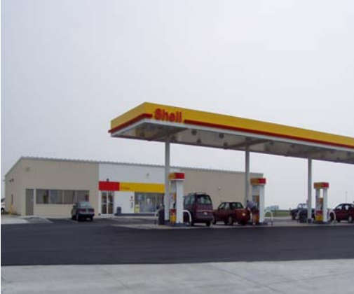
Reasonic Group Project, Toluca-2005