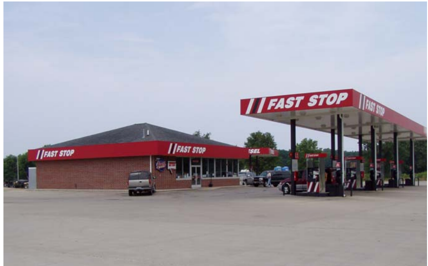
Henry Fast Stop Project, Henry-2005

Welcome to the Marshall County Area Enterprise Zone including Henry, Lacon, Sparland, Toluca, and Wenona, Illinois