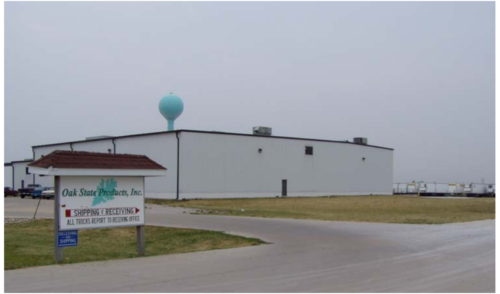
Oak State Products Project, Wenona-2005