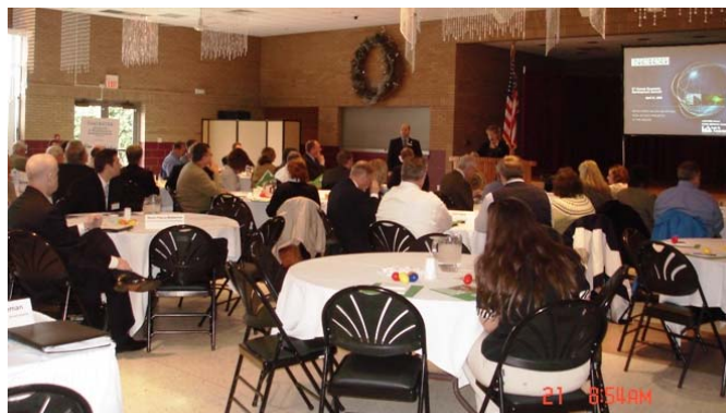
Left: Summit Audience at Celebrations 150