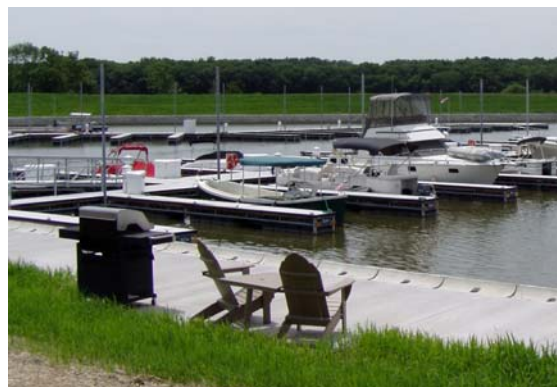
The marina at Heritage Harbor project in Ottawa