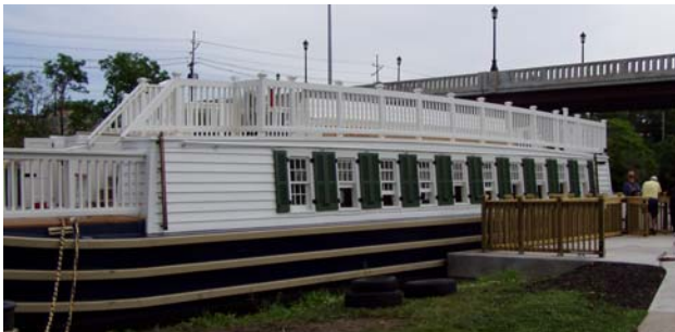
The Volunteer Canal Boat at Lock 14 in LaSalle

The Illinois River Road Board also visited the Heritage Harbor Marina project in Ottawa. The Heritage Harbor Project is a marina-resort vacation community development on the Illinois River in Ottawa. This project features a full-service marina offering over 450 slips, plus marine sales and service. When completed there will be over 700 residential units of condominiums, cottages and river row cottages. Construction of the residential units began this spring following the completion of the 32-acre marina.